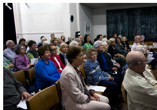
An attentive audience at the CSH Forum 'Children Remembering Hurt'.