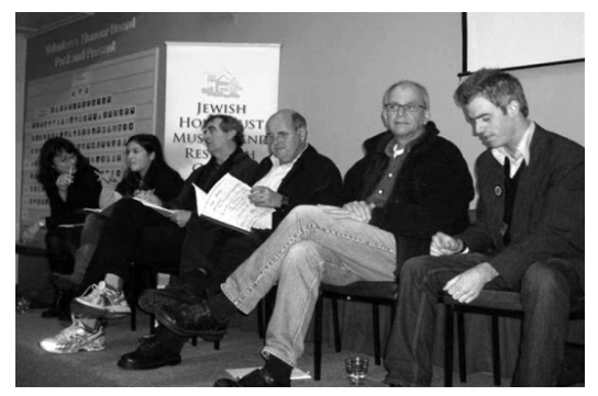
Cast who took part in playreading.