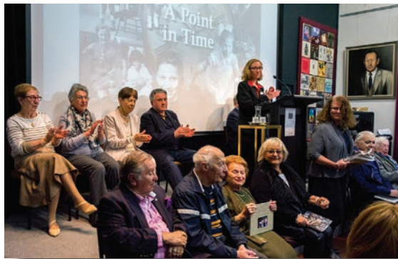
CSH Contributors on stage.