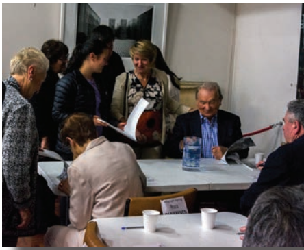
CSH contributors sign copies of anthology.

world irretrievably lost, the world too loses its innocence and has become irretrievably awry.